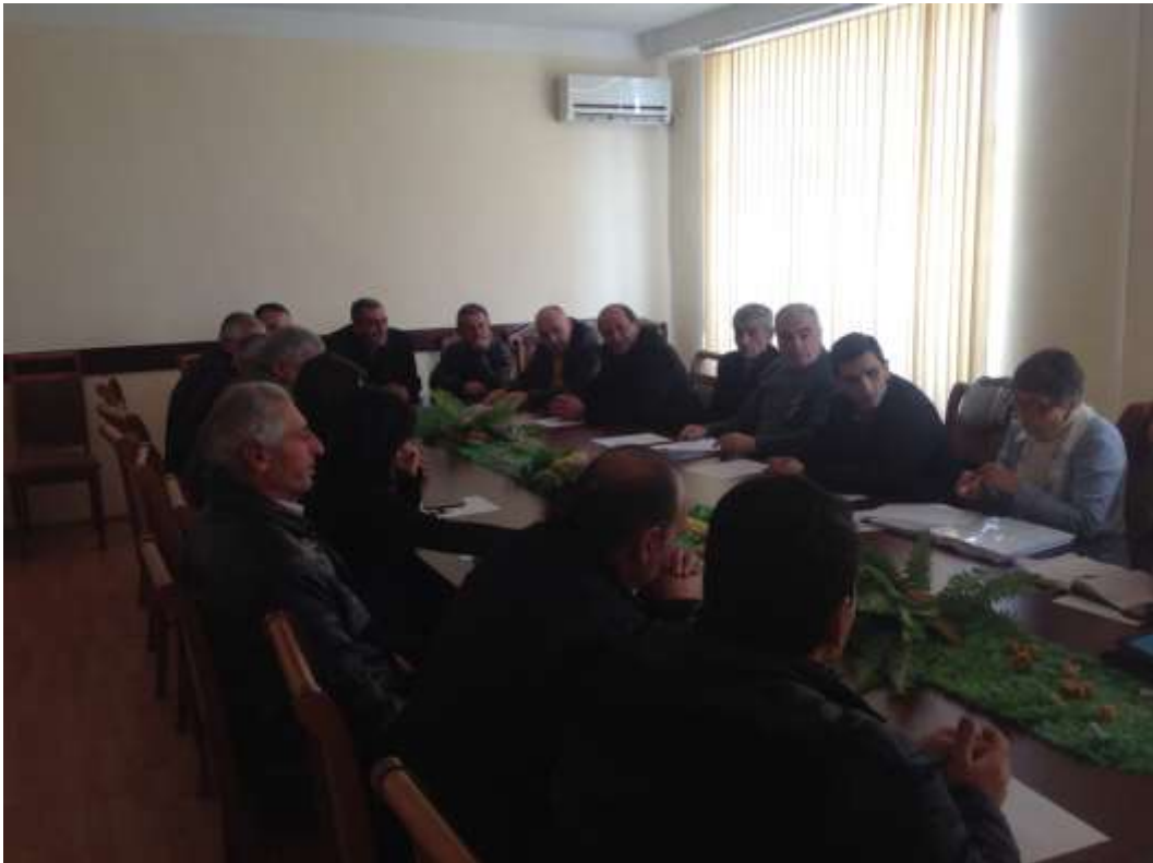
PCs in Gavar