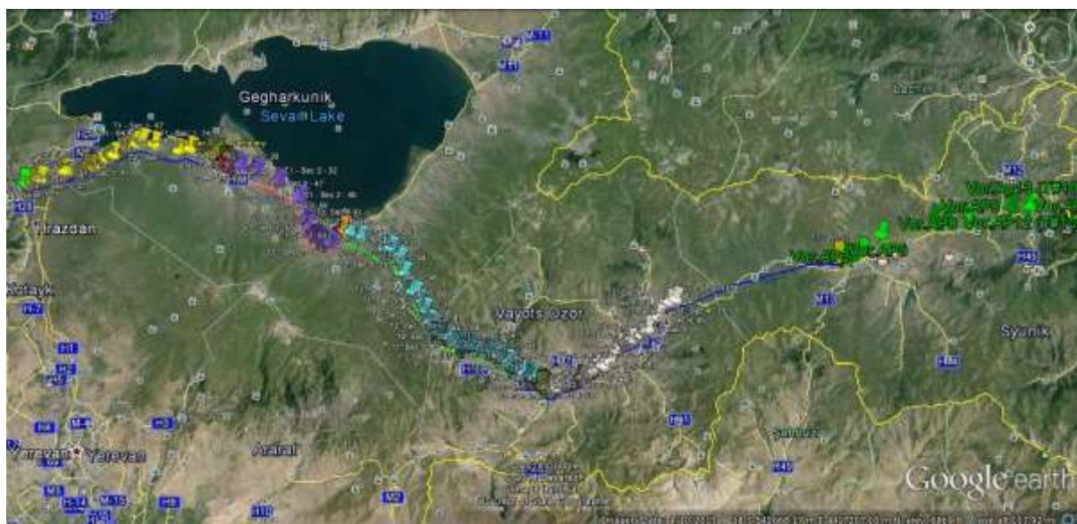
Figure 1 Project Location

3. The power transmission rehabilitation component comprises the five separate sections Noraduz (45 km), Lichk (25 km), Vardenis (45 km), Vayk (70 km) and Vorotan 1 (40 km) from the central regions (Kotayk Marz), via the city of Vayk, to Southern Armenia (Syunik Marz, City of Goris). Total length of the line is 232,5 km. Substations and power plants are located in Hrazdan (Hrazdan Thermal Power Plant), Gavar, Lichk, Yeghegnadzor, Shaghat village (Spandaryan Hydro Power Plant) and Shinuhayr.