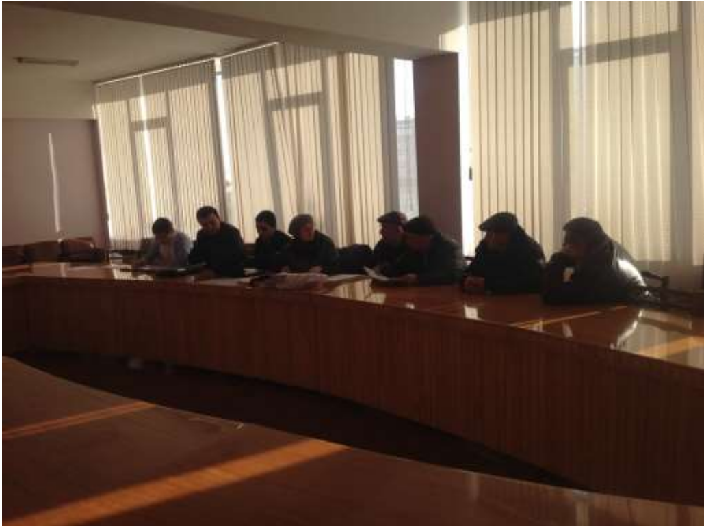
PCs in Hrazdan